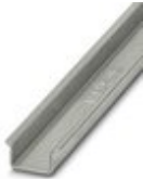
DIN rail, unperforated, Standard profile 2.3 mm, width: 35 mm, height: 15 mm, acc. to EN 60715, material: Steel, galvanized, passivated with a thick layer, length: 2000 mm, color: silver

DIN rail, unperforated - NS 35/15-2,3 UNPERF 2000MM - 1201798